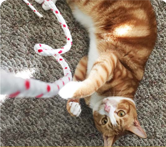
Briar received compassionate care for 528 days before finding his new home.